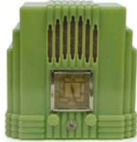
AWA Fisk Radiolette 'Empire State Radio', 1930s SOLD FOR $16,800