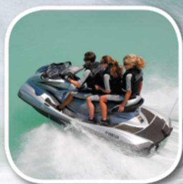
The High Power FX 160 Cruiser