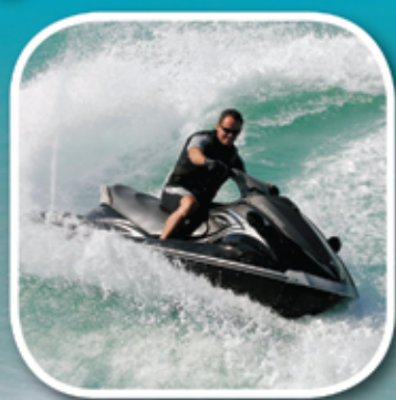
The Economical VX Deluxe